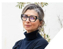
UN Special Rapporteur on the Occupied Palestinian Territory, Francesca Albanese